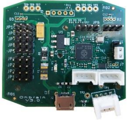
Ohbrain V3 Dev. Kit