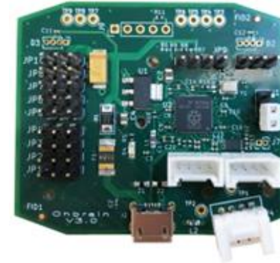
Ohbrain V3 board